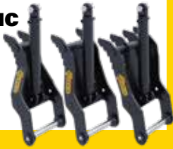
PROGRESSIVE HYDRAULIC THUMB