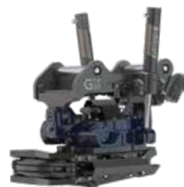
GTR28 For 22 to 30 ton excavators